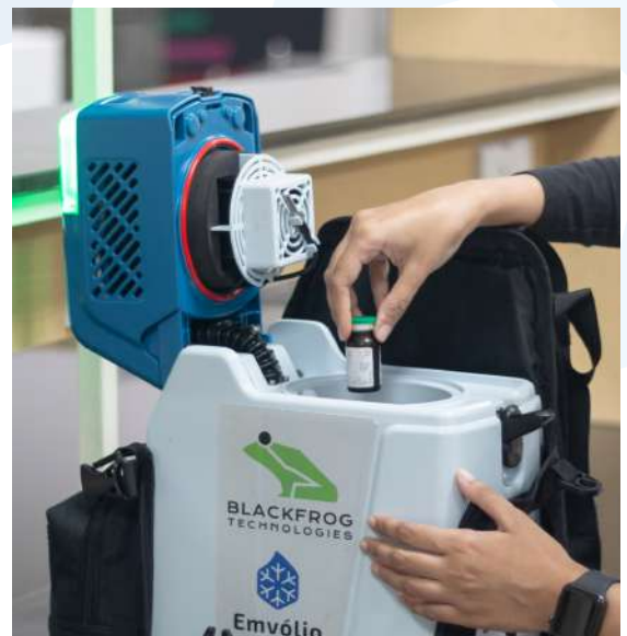
Stainless Steel 304 chamber for easy cleaning after use

Product available in 3 variants with a backpack or rigid carrying handle